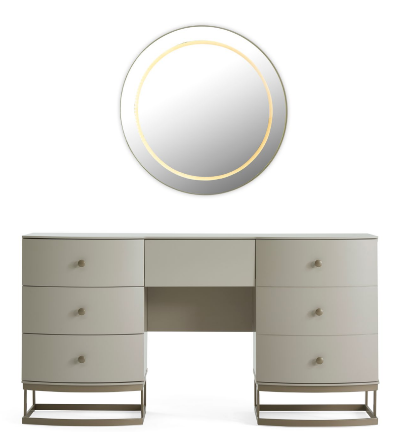
Style Meets Storage in Every Detail