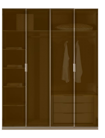
4 Kapılı Akordiyon Dolap/ Açma Kapılı Dolap