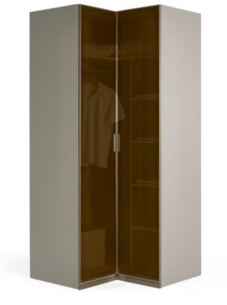
2 Kapılı Köşe Dolap