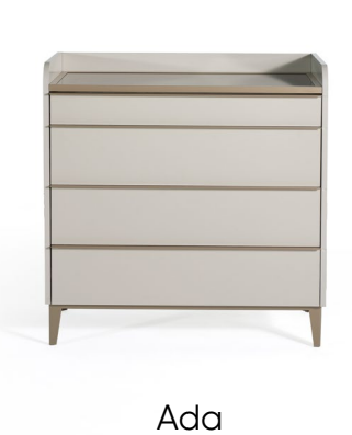
Functional Elegance In Every Detail